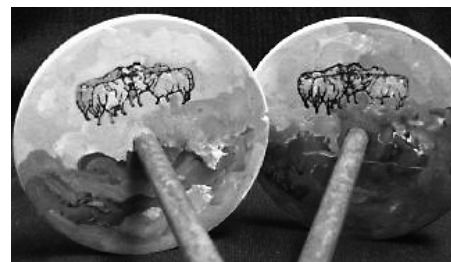
These hand painted spindles feature luscious fruit slices on one side and grazing sheep on the other.